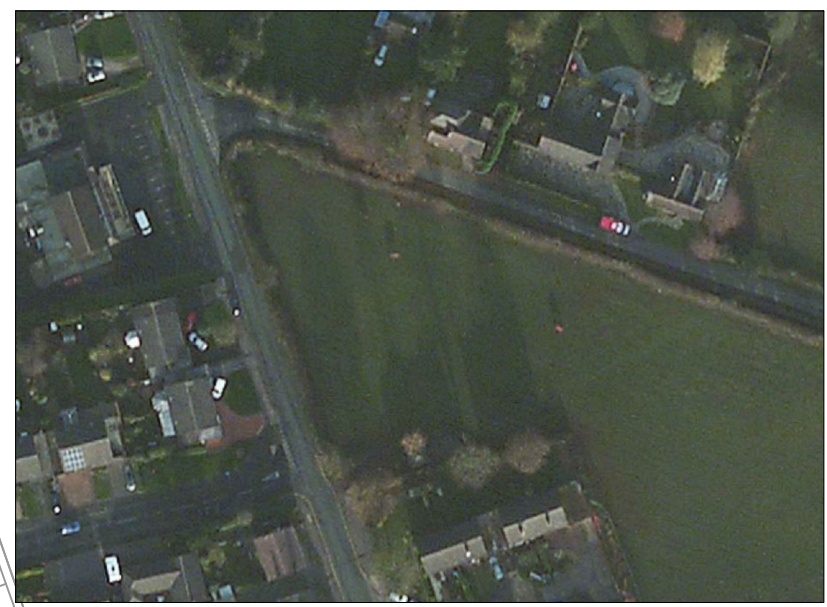
NORTH SOUTH AERIAL VIEW